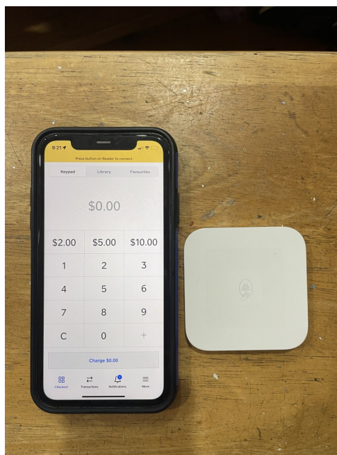
A Square Reader with a smartphone ready to accept credit card payments

Please note. In line with Tradition 6, AA does not endorse any product mentioned here. These names and details are provided just as one group's experience.