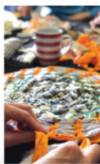
A Rag Rug in progress at the Nest Community