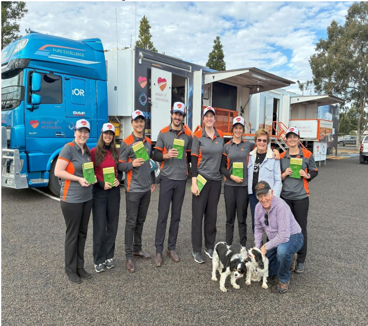
Seven of the Medical Students who were introduced to AA on the 2025 "AA Tag-A-Long"